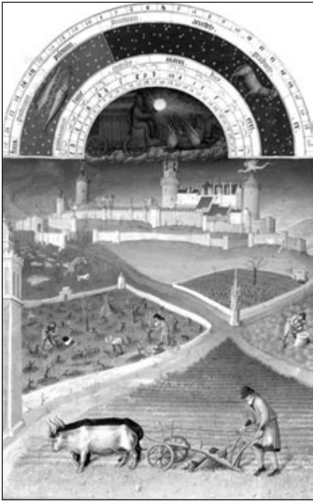
This vellum artwork shows serfs at work on a medieval manor.

Clustered around or near the castle or manor house were the huts and shops of the serfs and freemen who worked for the lord. Together with a chapel and a mill, these structures made up a small village. Beyond the village were the lord's fields, pasture land, and woods for hunting. Most manors in the Middle Ages were laid out in this fashion.